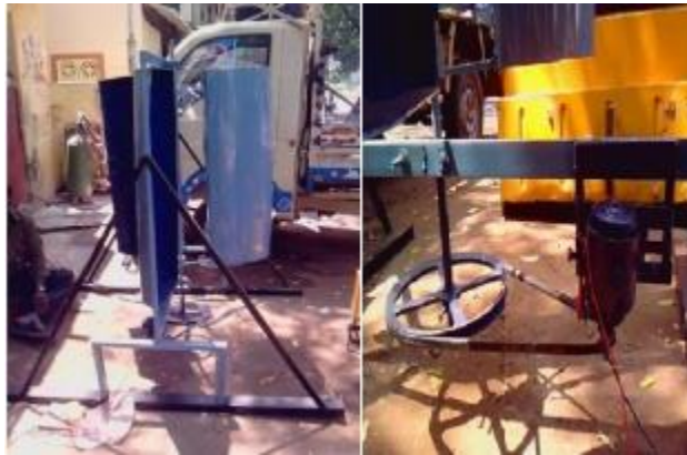
Figure 1: Experimental Setup