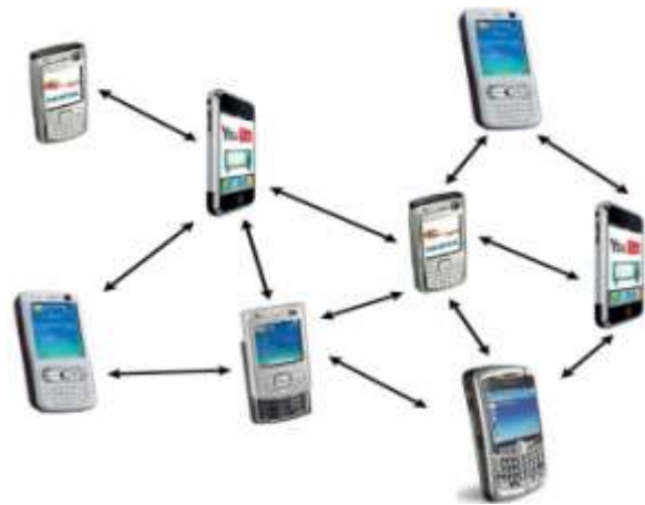
Figure 1: Shows That Scenario of Ad-Hoc Network

Sensor nodes is consumed due to its abundant use in various applications and it is a difficult task to recharge them frequently. Thus, the sensor is need to be configured in such a way that the lifetime of the network increases by effective utilization of nodes energy.